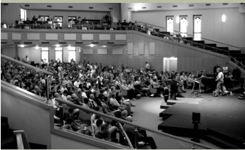
Recent Creation College near Cincinnati, hosted by Answers in Genesis