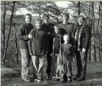
The Cooks in West Virginia